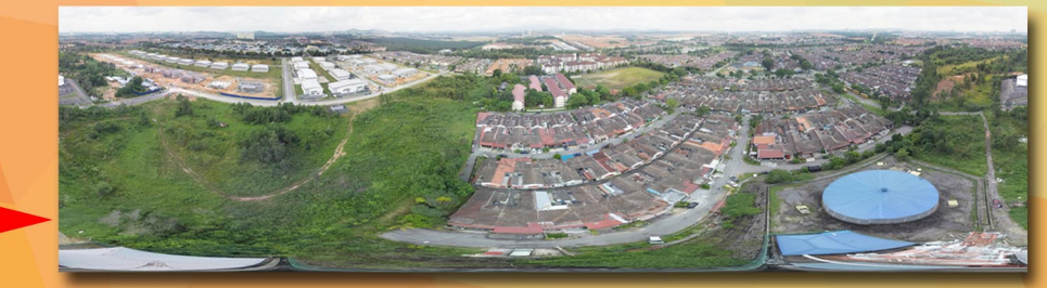
360 Degree Image View