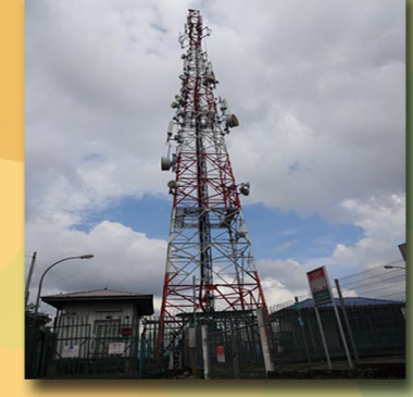
Overall Tower Image