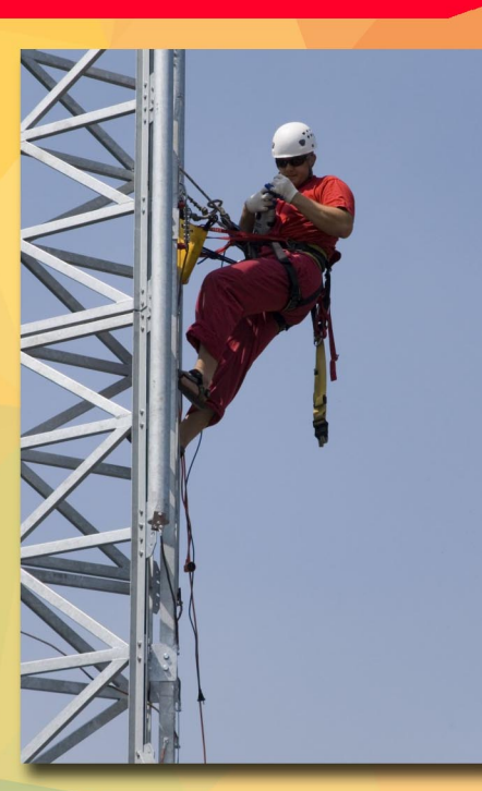
Manual Inspection Operation 3~4 hours per inspection work