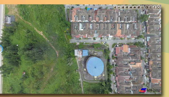
Tower Plan Layout