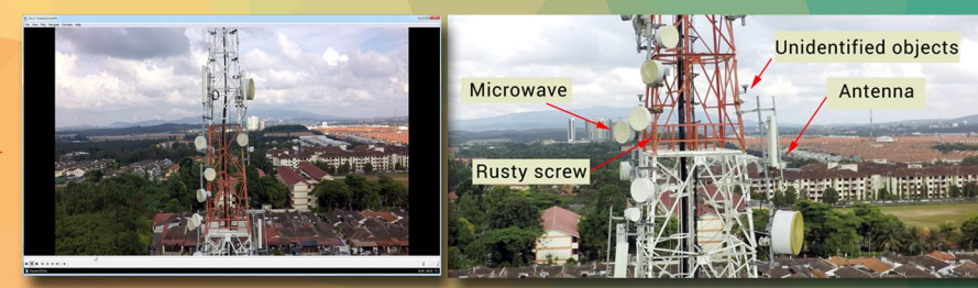
High Resolution Video