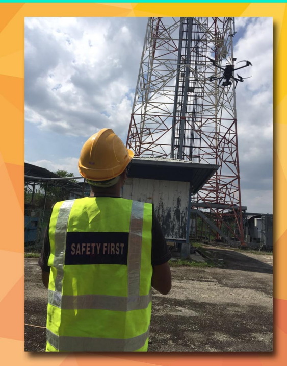
Drone Inspection Operation + Overall Tower Profiling 20 minute flight per inspection work